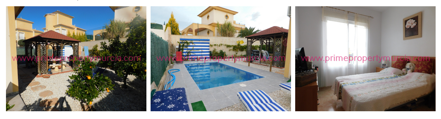
Important Notice: These details have been produced in good faith and are believed to be accurate based upon the information supplied but they are not intended to form part of a contract. You are strongly advised to check the availability of the property before travelling any distance to view. Any intending purchasers must satisfy themselves by inspection or otherwise as to the correctness of each of the statements contained in these particulars.