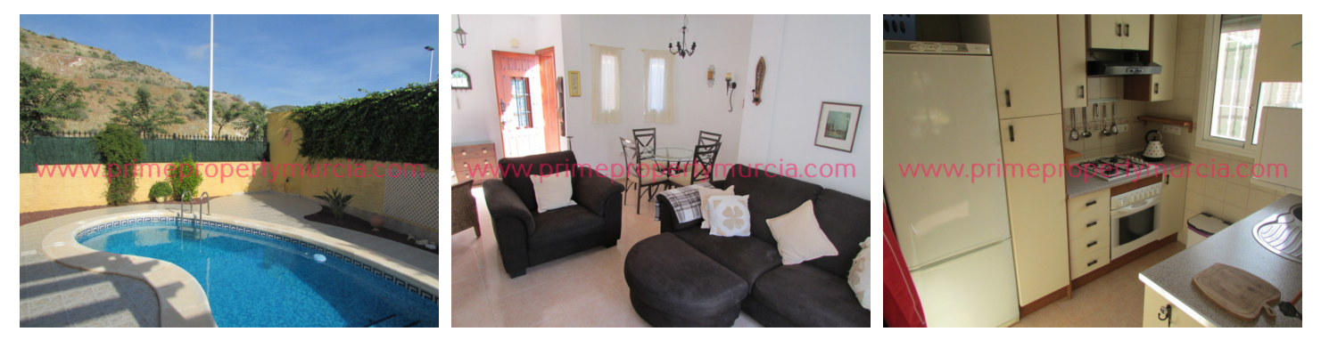
Important Notice: These details have been produced in good faith and are believed to be accurate based upon the information supplied but they are not intended to form part of a contract. You are strongly advised to check the availability of the property before travelling any distance to view. Any intending purchasers must satisfy themselves by inspection or otherwise as to the correctness of each of the statements contained in these particulars.