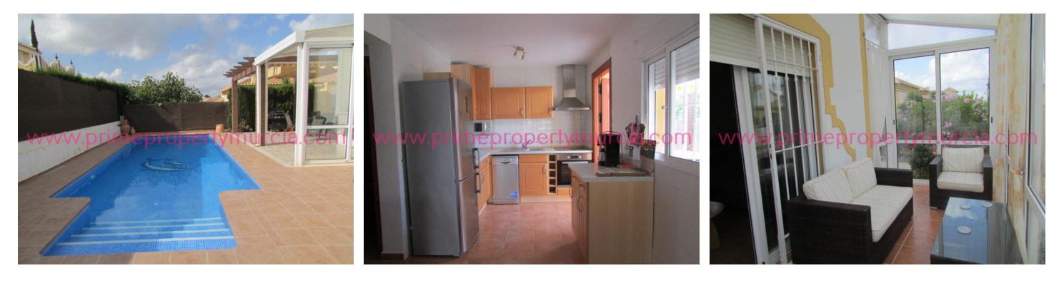
Important Notice: These details have been produced in good faith and are believed to be accurate based upon the information supplied but they are not intended to form part of a contract. You are strongly advised to check the availability of the property before travelling any distance to view. Any intending purchasers must satisfy themselves by inspection or otherwise as to the correctness of each of the statements contained in these particulars.